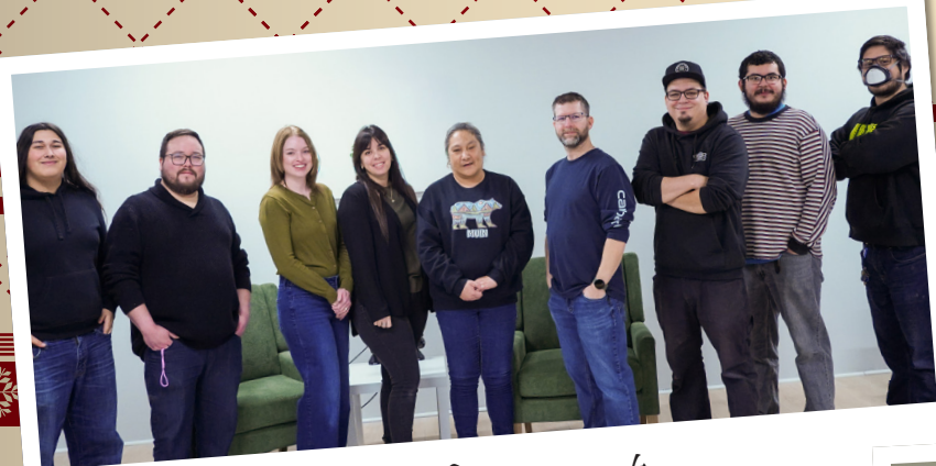
IT and Communications