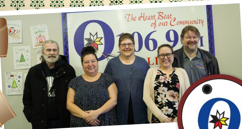
CHRQ 106.9 FM