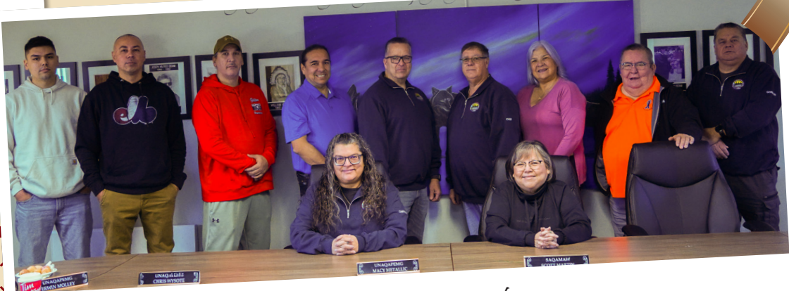
Chief and Council