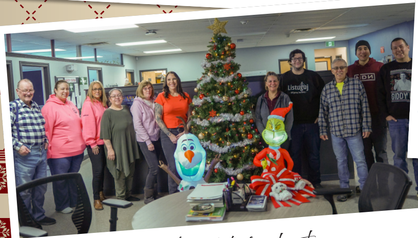
Capital and Infrastructure