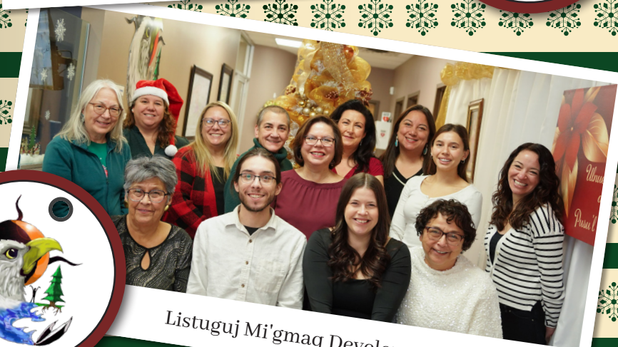
Listuguj Mi'gmaq Development Centre