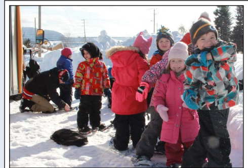
Forest Kindergarten students getting ready to go out on the Gespegewa'gi Recreational Trails.

"Whatever they do outside, they learn from it – they're the ones that look for what they want to learn," she said. "They feel a sense of ownership to what they're learning and once a child feels