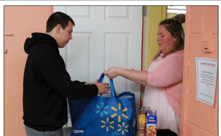
The food bank is typically held on the third Tuesday of every month. Anyone in need is welcomed.