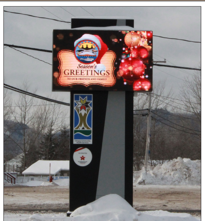
The new electronic billboard in the middle of Listuguj. It will deliver messages to the community 24 hours a day, seven days a week.

“I wanted to be able to have that on the sign,” she said. “I also wanted to showcase that the Health Center is an accredited organization, and it was a lot of work with staff and accred-