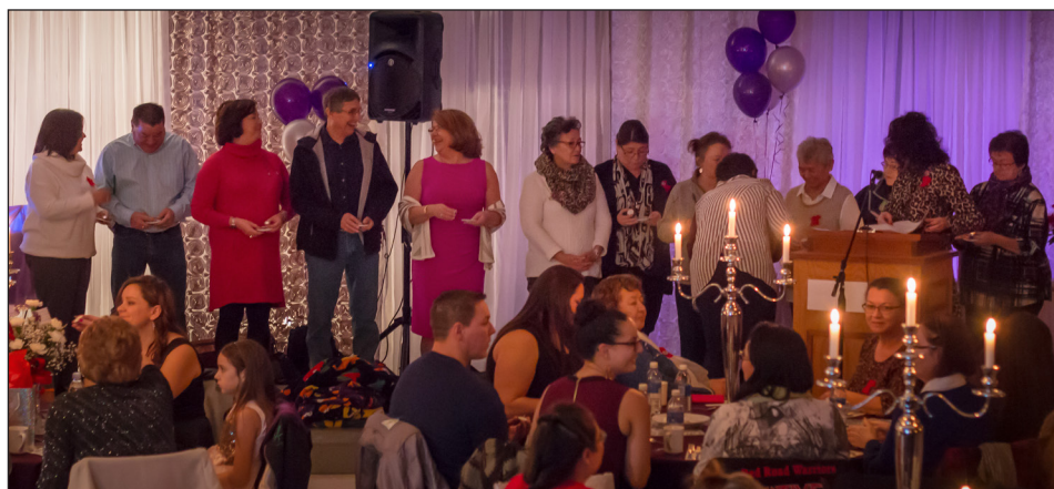
Members of Council from 1991, being recognized at the Haven House 25th anniversary for their part in helping create the shelter.