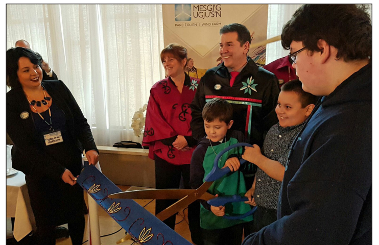
The ribbon cutting in Carelton, QC on December 1st.