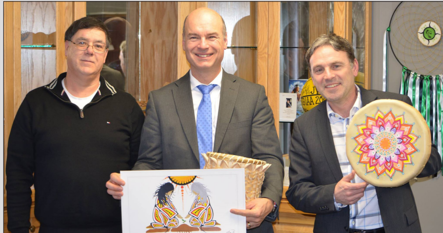
Representatives from the LMG engaged in discussions with Rene Arsenault (right), the Liberal representative from New Brunswick, and Remi Masse (center), the Liberal Representative from Quebec. The outcome of the meeting was extremely positive. Discussions ranged from point of sale tax to historical presence in New Brunswick and exercising rights to the land.

Scan this QR code to read the full story at news.listuguj.ca