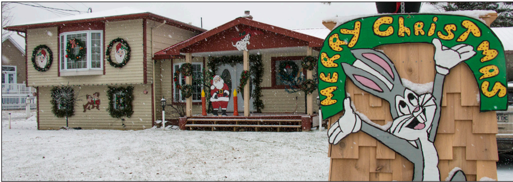
The Harmony Project invites everyone from Listuguj and Pointe-à-la-Croix to decorate their homes for the 12th annual Christmas home decoration competition.