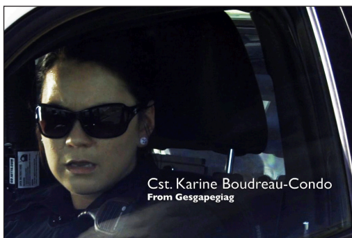
Screenshot from “LUJ 051,” a film by Mallory Metallic.

Mallory Metallic’s film is driven by curiosity – what is it like to work at the Listuguj Police Department, and not be from here?