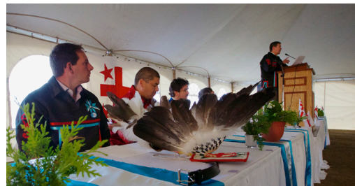
The groundbreaking at the Mesgi'g Uguj's'n Wind Farm on June 22.