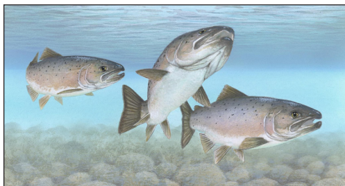
Artist depiction of Atlantic salmon.

The good news is more salmon have been recorded so far this year in comparison to last.